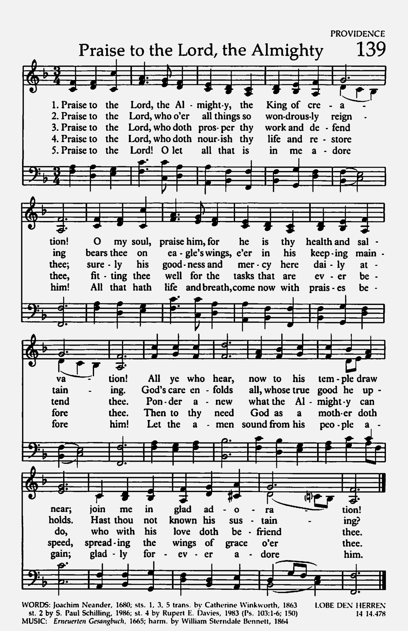
Trans. sts. 2 and 4 $ 1989 The United Methodist Publishing House